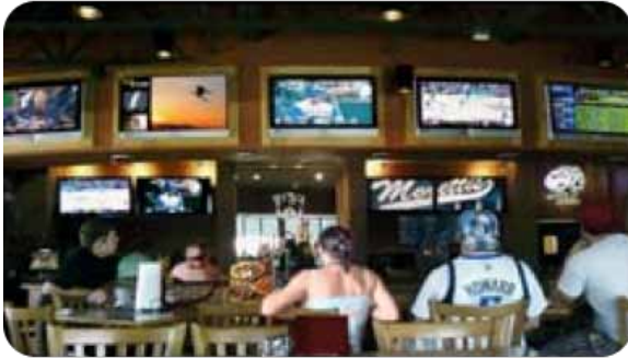
In Sports Bars